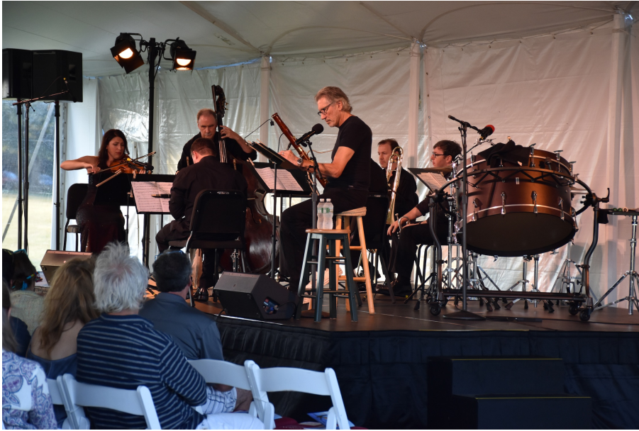
Bridgehampton Chamber Music Festival WM. Brian Little Concert – Roger Waters in “A Soldier’s Tale.”