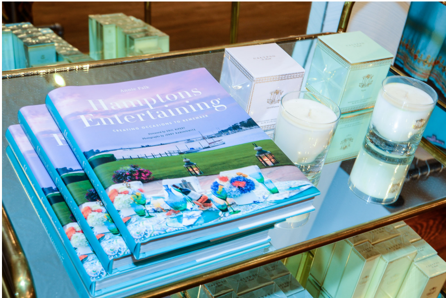
Your new Hamptons entertaining guide

mingled with the author of the newest go-to guide for throwing the ultimate Hamptons bash, featuring more than 80 delicious recipes like Watermelon Margarita and Cold Peach Soup. Proceeds from Falk's book will benefit Peconic Baykeeper , which works to protect and improve the aquatic ecosystems of the Peconic and South Shore estuaries on Long Island.