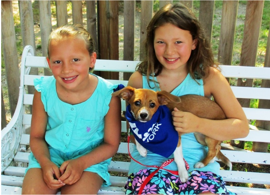
Twenty pets found their forever homes at Southampton Animal Shelter Foundation as part of NBC's Clear the Shelters initiative

Here are our favorite Instagram photos from the weekend in the Hamptons. Headed out East? Use the hashtag #LIPulseWeekends and you could be in our social media recap. Be sure to follow us on Facebook , Twitter , Instagram and Pinterest .